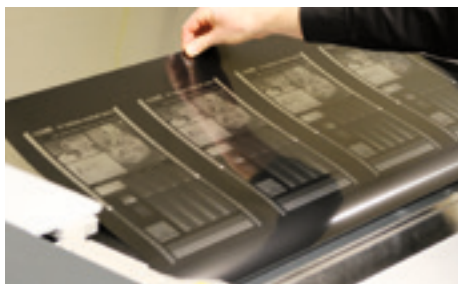
Imaging with IR-laser