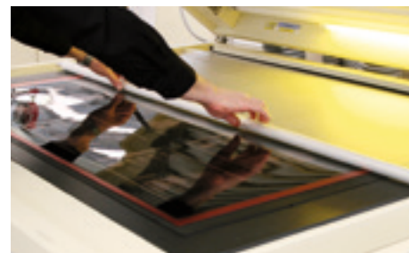
Precise reproduction to printing plate