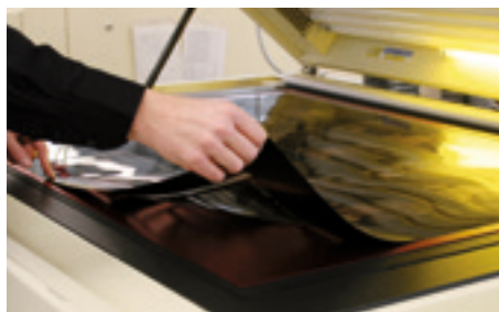
The LADF can be used without prior cleaning