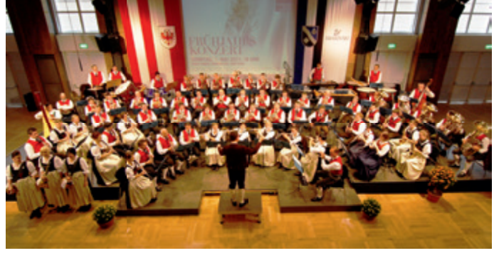
Figure: Marching Band Swarovski Musik Wattens

Thickness: 0.115 / 0.140 / 0.190 / 0.265 mm Article Number: 29738.XXX.XXXXX